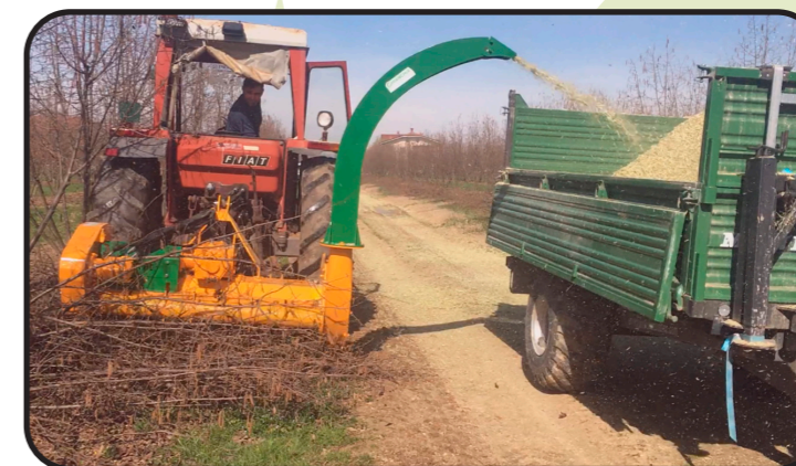
▶ Discharge chute