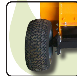
▶ Fixed rear wheel