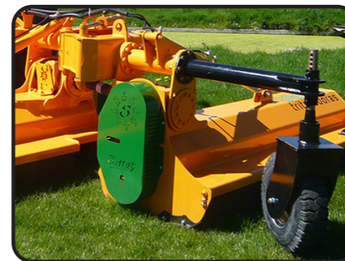
▶ Preparation for reversible tractor