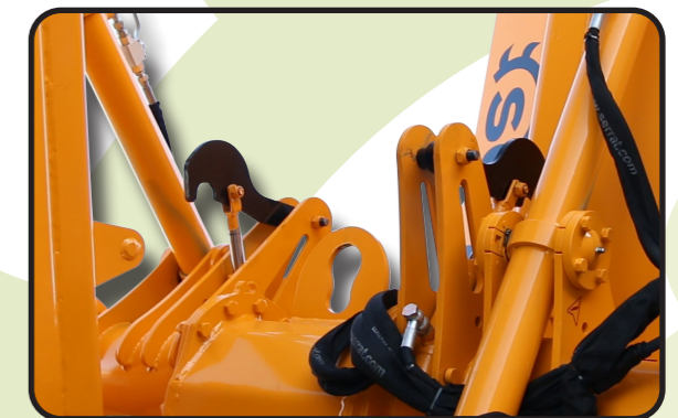
▶ Hydraulic safety systems for transport