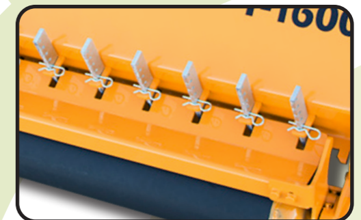
▶ Rear tine retainers