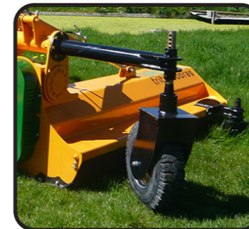
▶ Preparation for reversible tractor