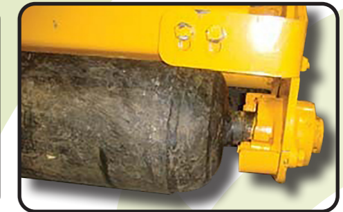
▶ Reinforced roller