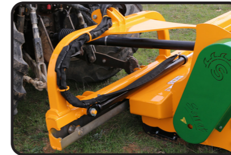
▶ Super hydraulic side shift