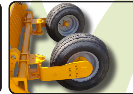
▶ Adjustable wheels