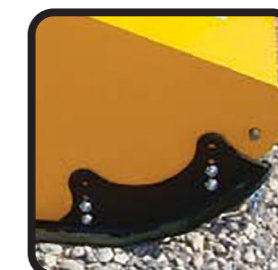
▶ Front skid shoes