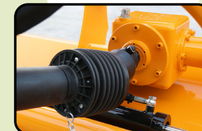
▶ Freewheel on transmission