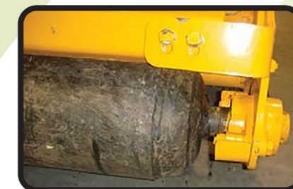
▶ Height adjustable rear roller