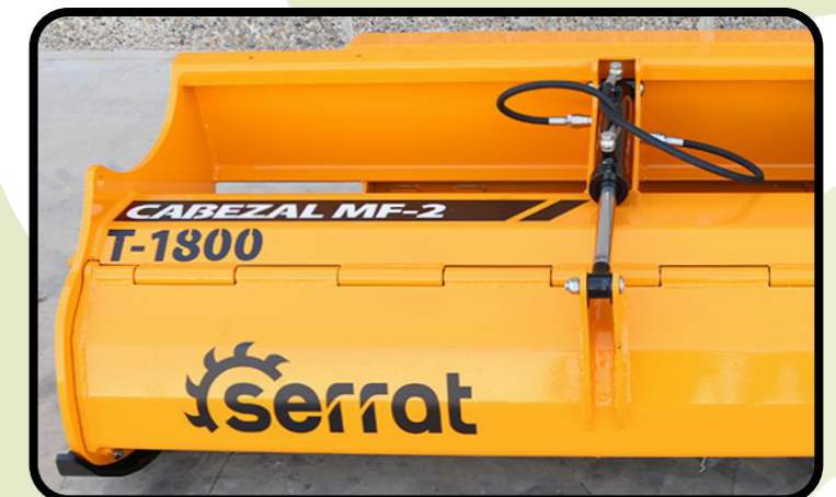
▶ Hydraulic rear hood