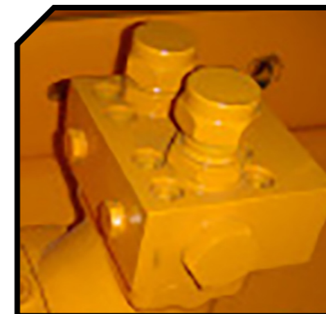
Valve of circulation