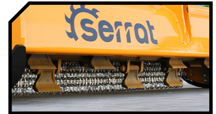
Safety chains (2)